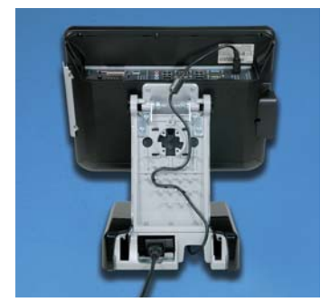
Integrated Power Supply and Cable Management Keeps Cords Hidden and Organized