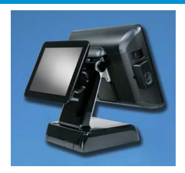
Optional Integrated 9.7" Rear LCD Customer Display