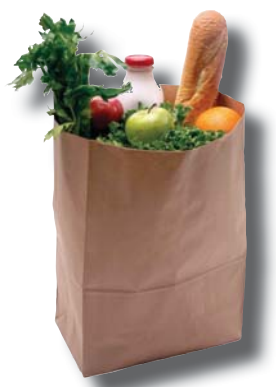
Convenience Stores / Small Grocery Stores