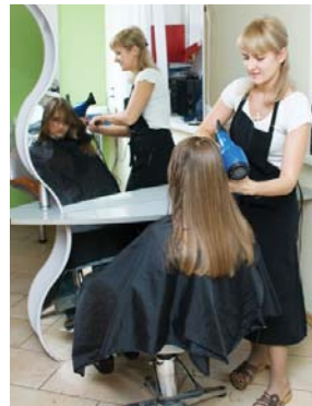
Apparel Stores / Salons