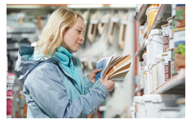
Hardware, Paint or General Retail Stores